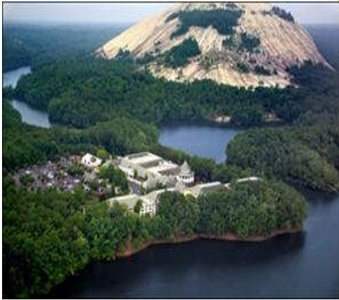
Stone Mountain Georgia