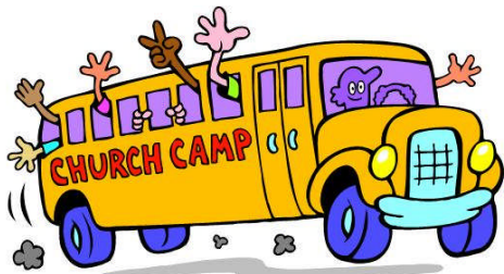
Atlanta Progressive Church Retreat